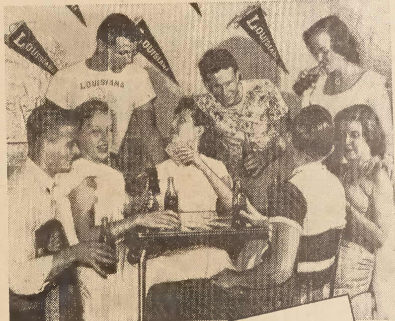
Field House University, Louisiana (Baton Rouge)