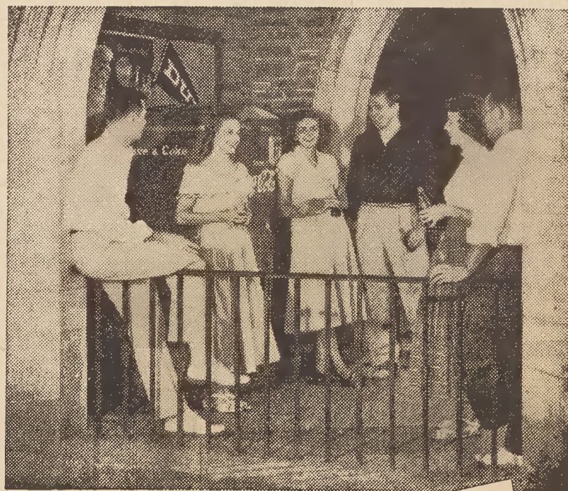
"Y" Duke University Durham, North Carolina