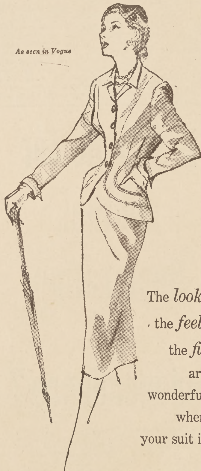
As seen in Vogue

The look, the feel, the fit are wonderful when your suit is