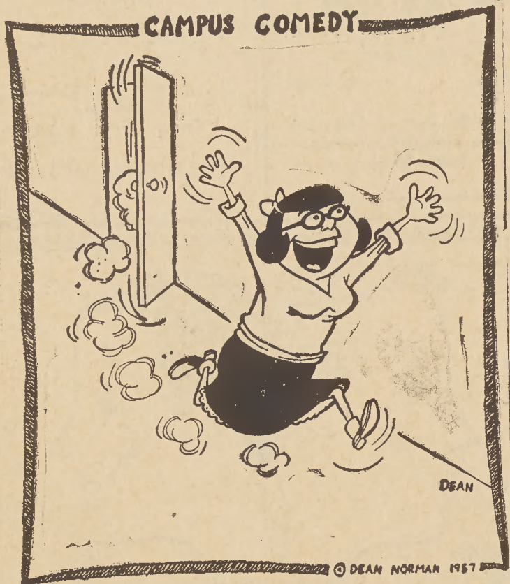
There's a man in my room! Lock the door!