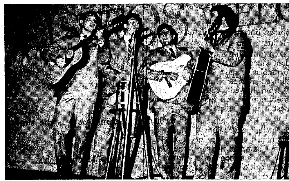
The Villagers entertain with "Hadley's Nightmare" at the Astro meeting.