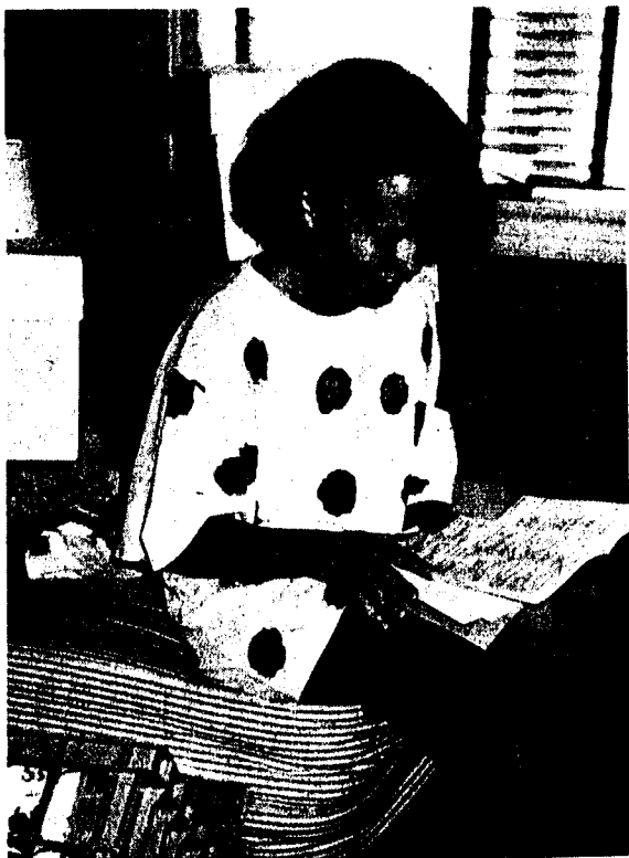
Taking a break from unpacking.

"Some of the programs such as Serendipity and Kalaidoscope were interesting and were helpful in letting you decide which classes to