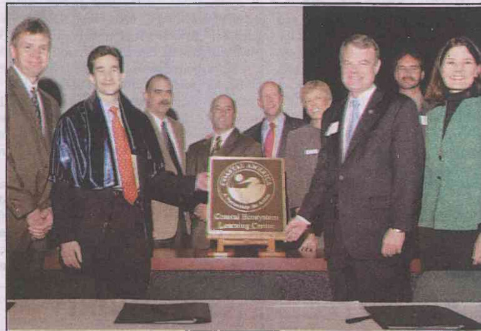
Aquarium directors, federal officials, Coastal America representatives, state and federal congressional representatives and local dignitaries attended the North Carolina Aquariums' recognition ceremony, designating the three state Aquariums as Coastal Ecosystem Learning Centers. The ceremony was held in January at the N.C. Aquarium at Fort Fisher.

The Pine Knoll Shores Aquarium continues its winter programs, with birding trips, seafood cooking classes, programs for youngsters and other activities. To find out what's going on, check our website at www.ncaquariums.com , or call 247-4003.