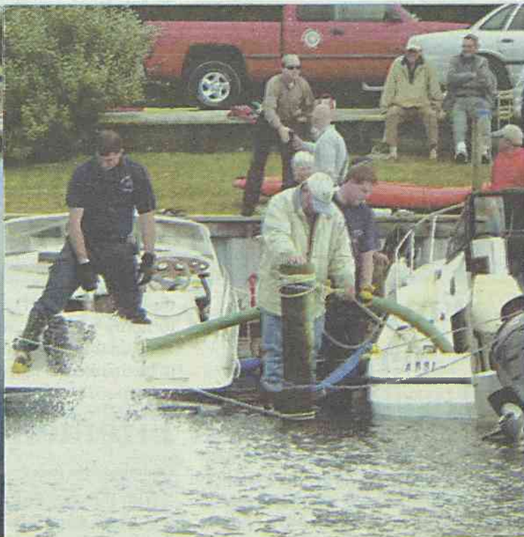
Team Work – PKS firemen and a group of neighbors used muscle and a volunteer's plan of action to refloat this craft that foundered at its Hall Haven Marina moorings during the November nor-easter.