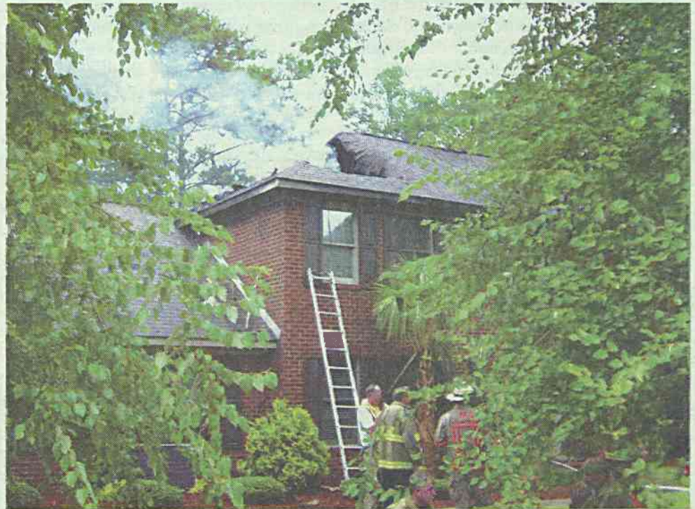
Lightning Victim – Gaping holes in the roof testify to the intensity of the fire that raged through the attic of the Curtis house after it was struck by lightning.

The others who have filed to run (Two-Way Mayoral Race) Continued on Page 2