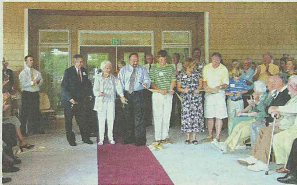
Dedication Day – Members and officials of the Country Club of the Crystal Coast snip the ribbon to officially dedicate their new clubhouse at ceremonies August 18.

Standard Pre-Sort Permit #35 Atlantic Beach, NC 28512