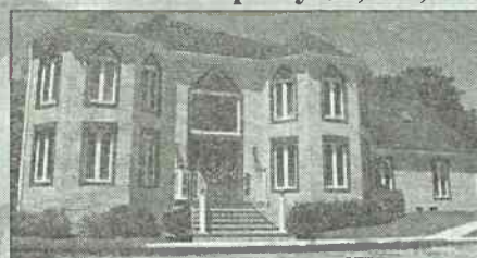
101 Cypress Drive $795,000