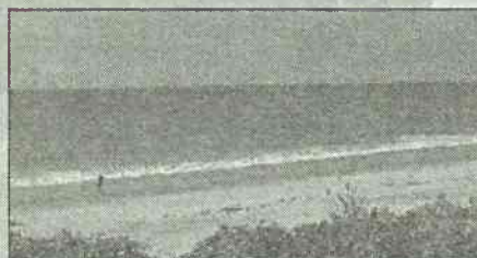
C3 Breakers $475,000

If You Really Want To Sell It... CALL US!