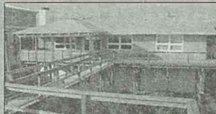
121 Knollwood Dr. $1,470,000