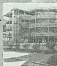
B-24 Breakers $450,000

If You Really Want To Sell It... CALL US!