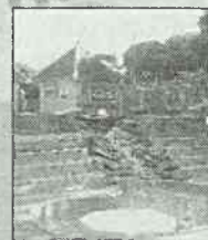
#11 Genesis $539,000

If You Really Want To Sell It... CALL US!