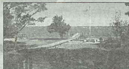
Soundfront Property $1,447,000