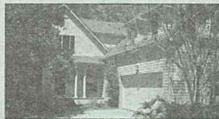
126 White Ash Court $697,000