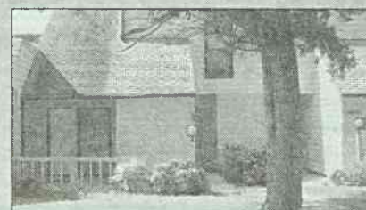
E-23 Reefstone $289,000