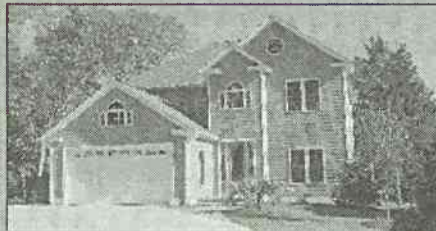
146 Arborvitae Dr. $837,000

We Can Show & Sell You All Properties Listed In Our MLS System. Call Us.