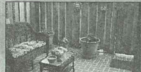
76 Pine Knoll Townes $327,000