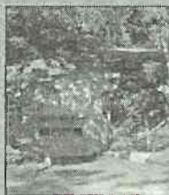
123 Mimosa Blvd. $299,000

If You Really Want To Sell It... CALL US!