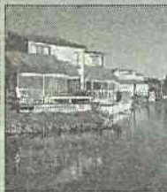
B-10 Reefstone $259,000

If You Really Want To Sell It... CALL US!