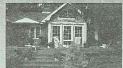
110 Willow Road $437,000