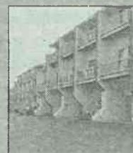
17 Coral Shores $537,000

If You Really Want To Sell It... CALL US!