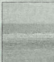
#5 Sunbay $597,000

If You Really Want To Sell It... CALL US!