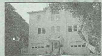
615 Westport Woods $597,000