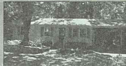
105 Locust Ct. $277,500