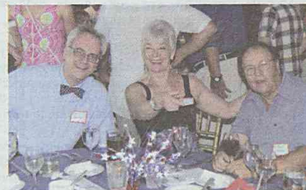
Table of three at the veterans event

The Town of Pine Knoll Shores had the distinct privilege of honoring the resident Korean War Veterans on June 24, 2010, at town hall, followed by a dinner at the Country Club of the Crystal Coast. The Korean War became known as the "Forgotten War," thus we have "forgotten veterans" of that war, many of whom served in combat with little training and inadequate weapons, risking their lives, when called. Some gave their lives; still others served elsewhere during that era, ready to do what was needed when required. Whatever their role, they were honored for their service.