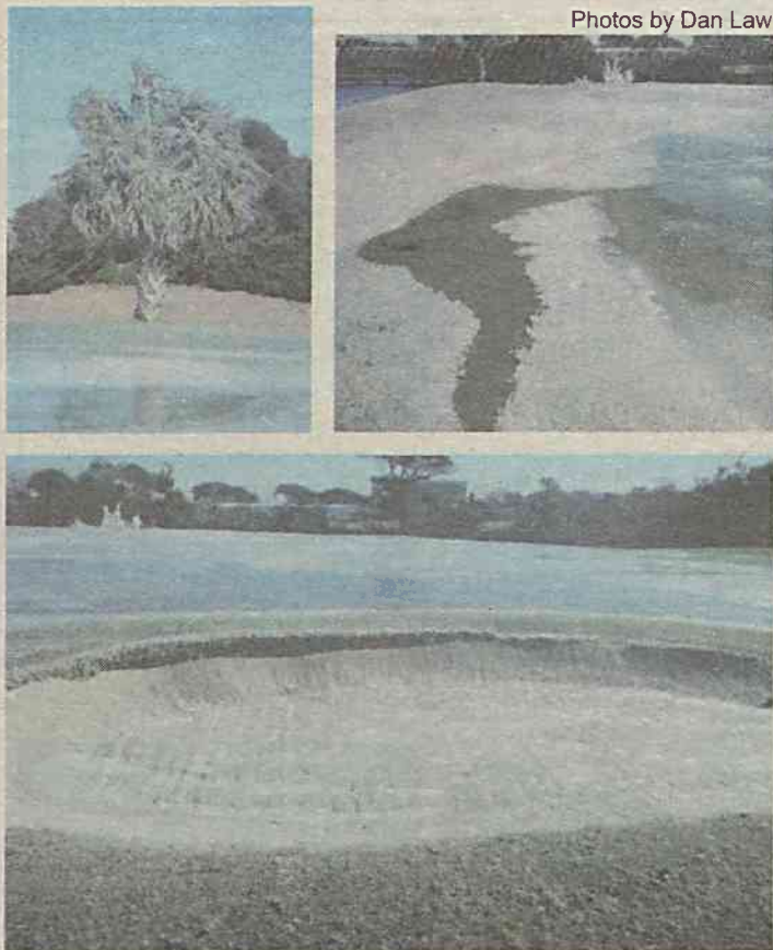
Bitter temperatures and a brisk wind combined in early January to produce these winter images on Hole #15 of the golf course at the Country Club of the Crystal Coast.