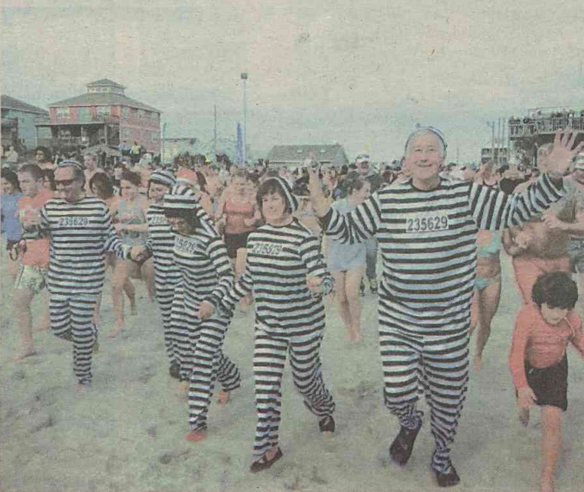
Another en was caught Haystacks