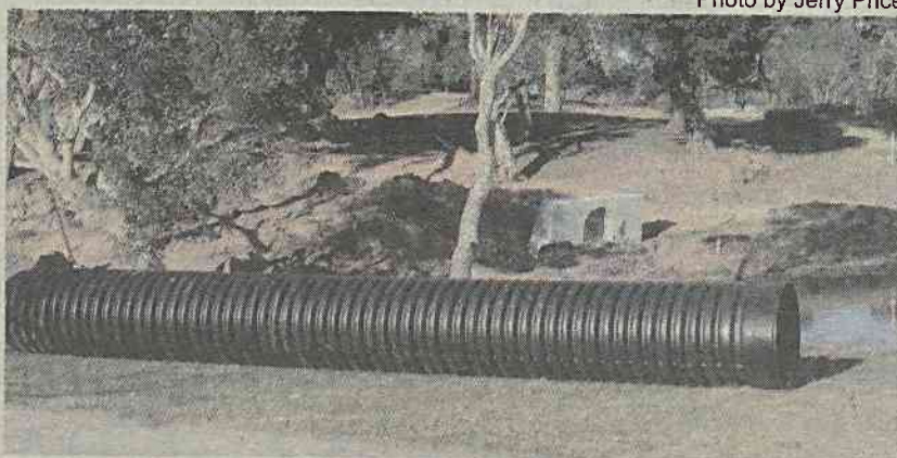
This East End Stormwater Project work on the grounds of the Country Club of the Crystal Coast should be finished by the time this issue of The Shoreline arrives—and will bring welcome relief to the flooding on the east side of town during heavy rain.

ed his 10th birthday in mid- e whack at the Crystal Coast.