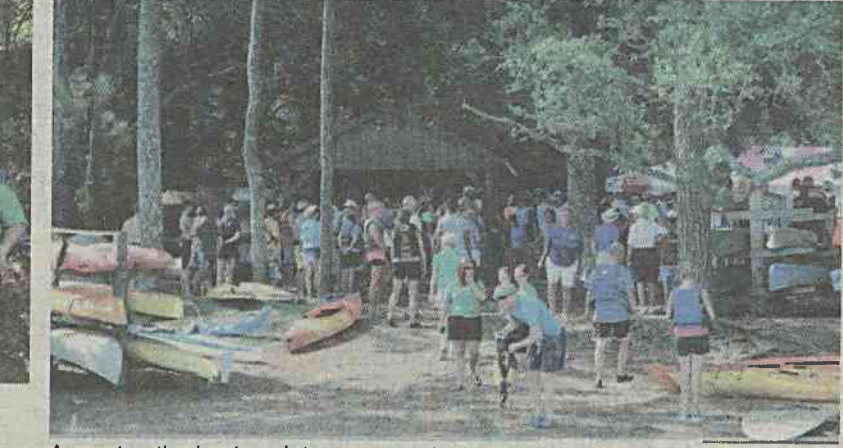
A great gathering to salute our wounded warriors.