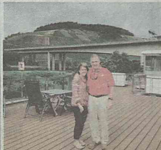
Later as they sailed west to east across Germany, mostly on the Mosel River, they were delighted to spot the hillside in the background from the sundeck of their cruise ship, planted with grapes to make German Riesling.