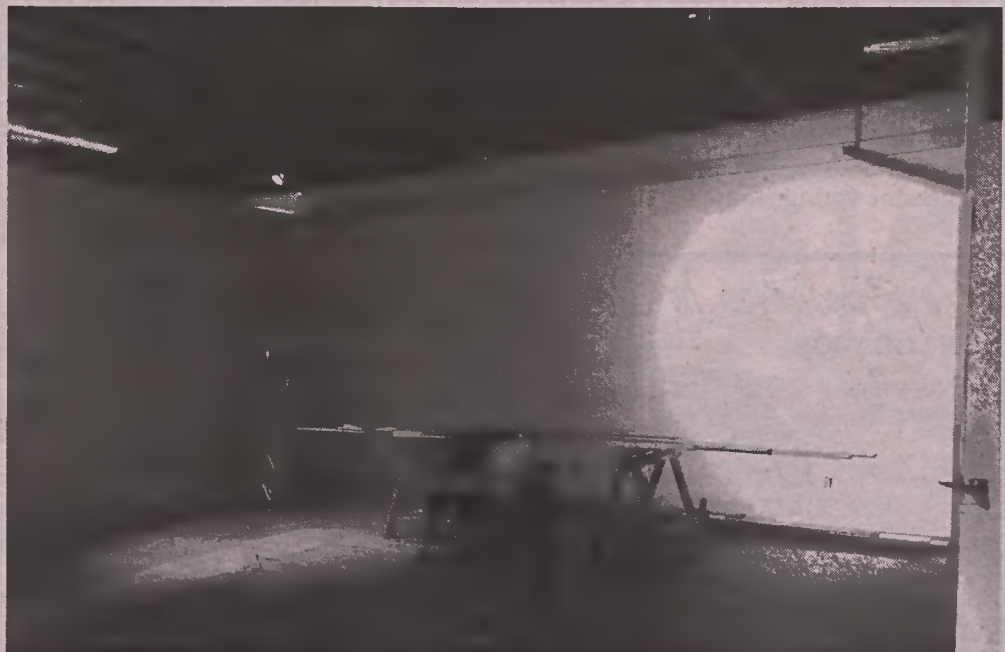
Construction is underway on the Rodney Kemp Gallery at the History Museum of Carteret County. The Pine Knoll Shores History Committee will be the first exhibitor with "Pine Knoll Shores: A Beach Town in a Forest."

An exact date has not been set, but the exhibit will open sometime in January 2016. It will be up for about a year, and then we will move as much of it as we can to town hall.