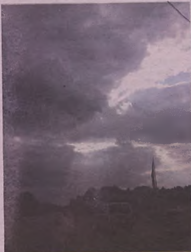
Storm on Highway 24 near Jacksonville