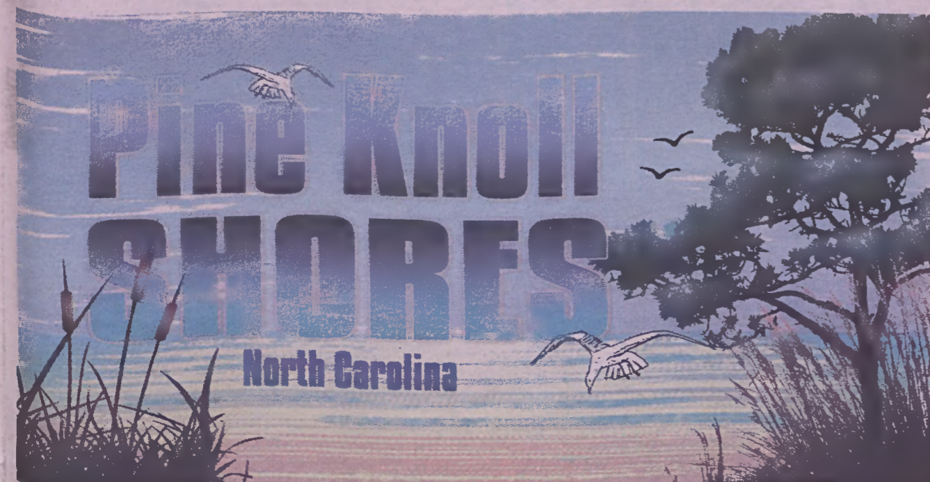
Pine Knoll Shores license plates are available for purchase at town hall.

The license plates are $20, with proceeds going to the Parks and Recreation Committee, and are available at the town hall.