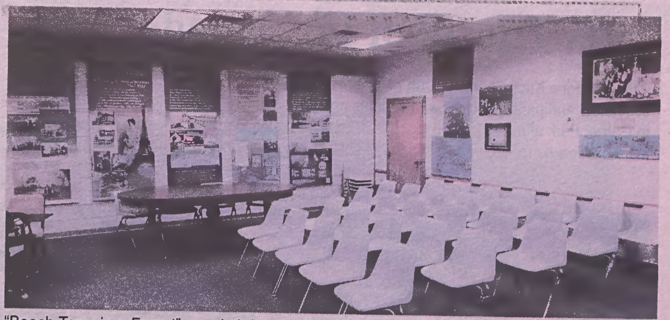
"Beach Town in a Forest" panels bring the Board Room alive with Pine Knoll Shores history.

Whether or not you saw the original "Beach Town in a Forest" at the History Museum, a visit to the board room at town hall to view this display will prove worth your time.