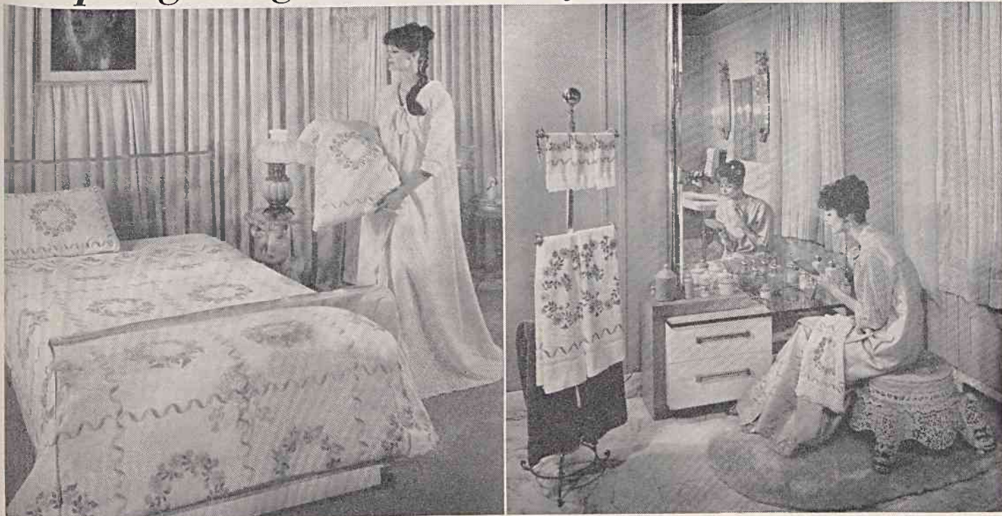
Bed and bath scene features our coordinated products in beautiful New York apartment of Helena Rubinstein.

One of the major promotions at Lord and Taylor this spring will be our coordinated group of sheets, cases, blankets, and towels called "Spring Song." Here you see a bed and bath scene fea-