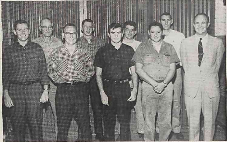
This group gave outstanding response to solicitations in Community Fund campaign.

He worked as a warper tender until he was promoted to spooler fixer in 1958. He continued to work as a spooler fixer until his latest promotion.