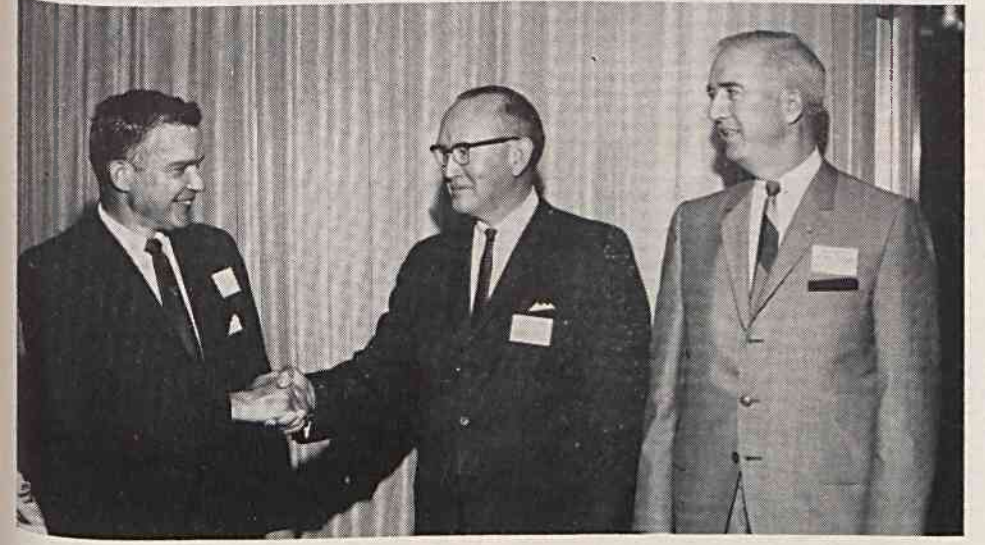
Fieldcrest Men Attend N. A. A. Meeting At Spray

FOR SALE: Record player; also washing machine, with new motor. Call 623-6015.