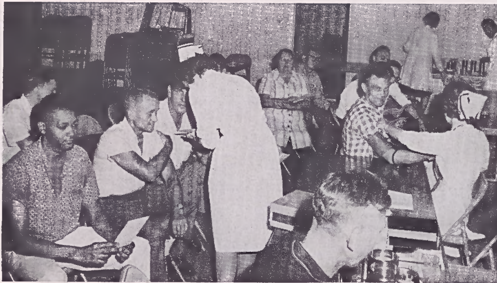
This picture was made during one of the rush periods when the Bloodmobile was stationed at the Leaksville Moose Hall Thursday, August 5. Note that plenty of nurses are available to take donors' temperatures, check pulses, blood pressures and hemoglobins.