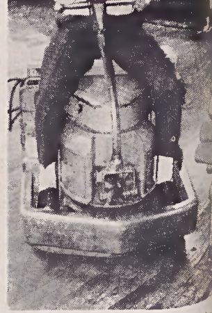
Here, rider demonstrates correct placement of feet.