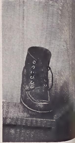
Shoe was torn open but safety cap saved his foot.