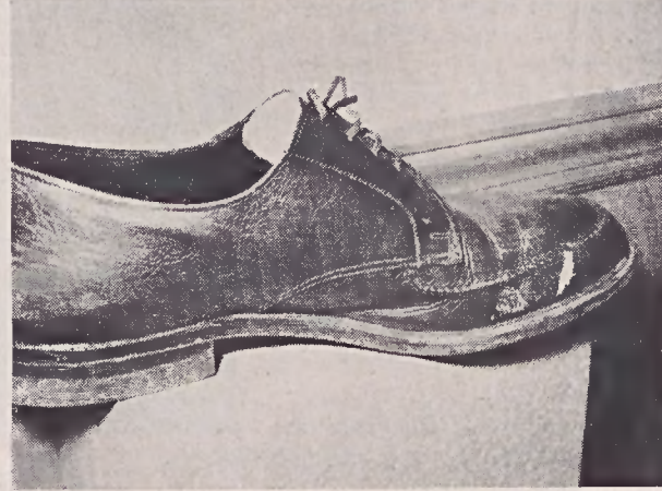
Safety shoe was torn but due to the steel cap in toe of shoe no injury occurred to the foot.