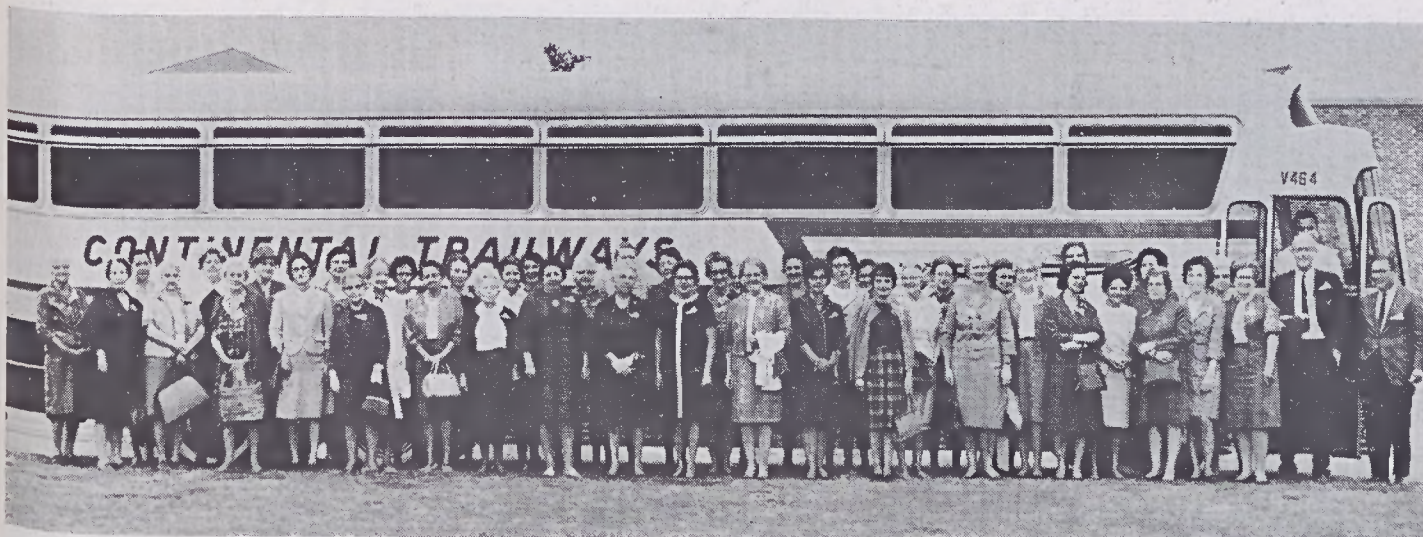
Home Demonstration Club ladies from Amherst County, Va., are shown upon arrival for tour of the Fieldcrest Store at Eden.