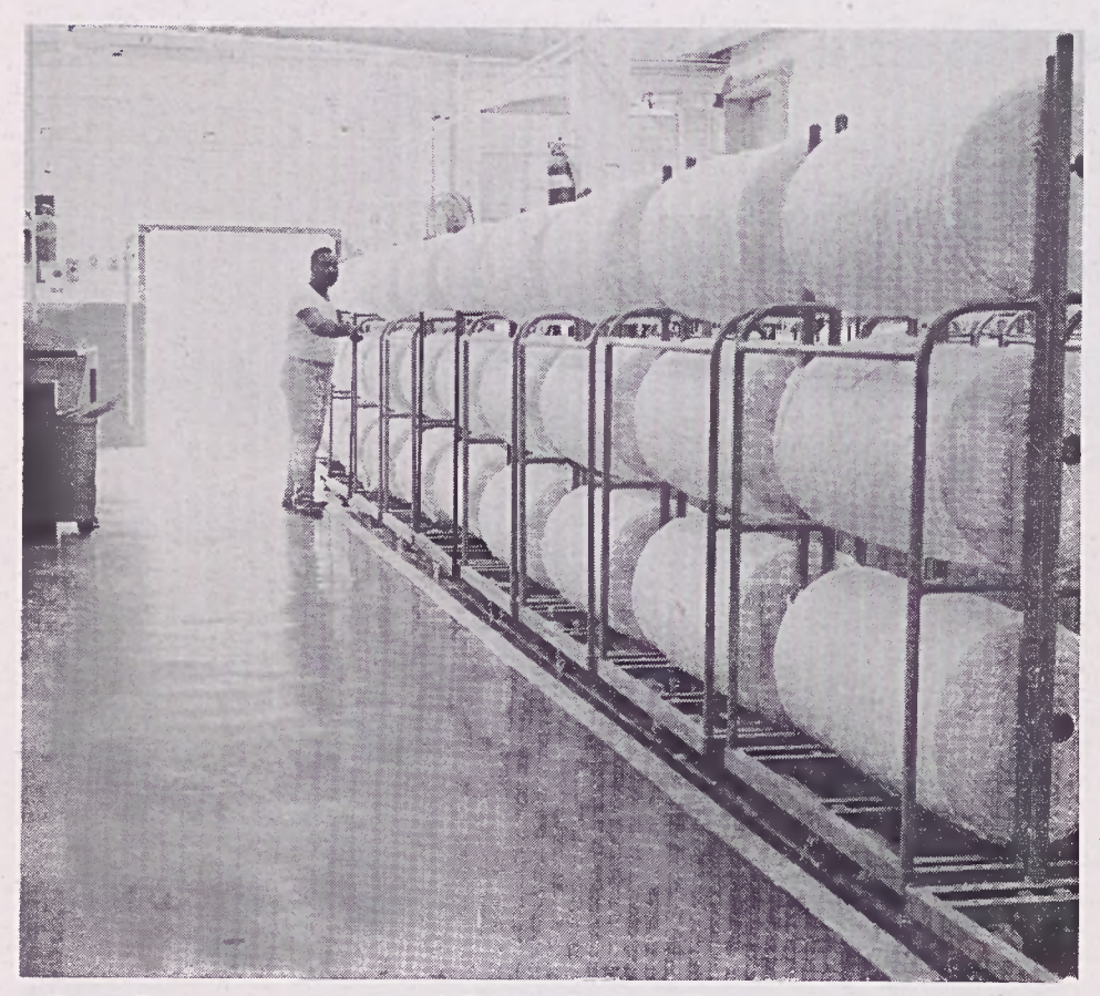
Picker Room was repainted and floors refinished. Floors were zoned for proper storage. Orderly placement of lap trucks aids efficiency as well as appearance.