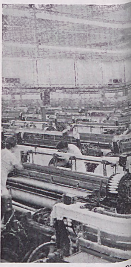
Following a fire last March, Weave Room and new lighting was installed. Loom

The pictures on these pages, made in some of the Sheeting Mill departments, show typical areas where the housekeeping has been greatly improved during the past several months.