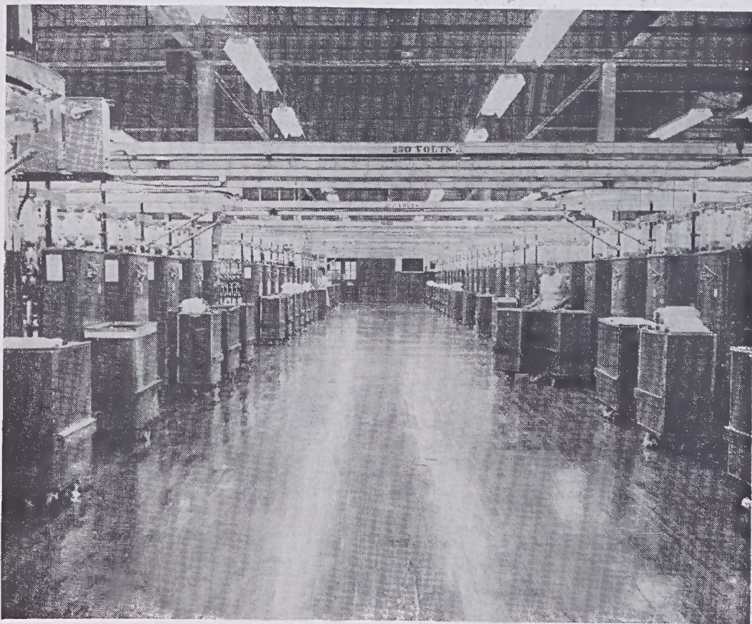
In the Spinning Department, machinery and floors are kept clean. This view shows main aisle with good zoning and orderliness. Boxes are in zoned areas at ends of frames.