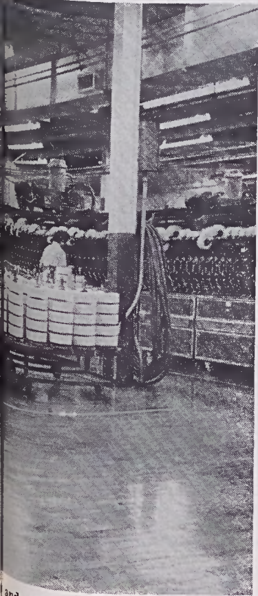
and attractive appearance. Trucks operations. Floors are kept clean.