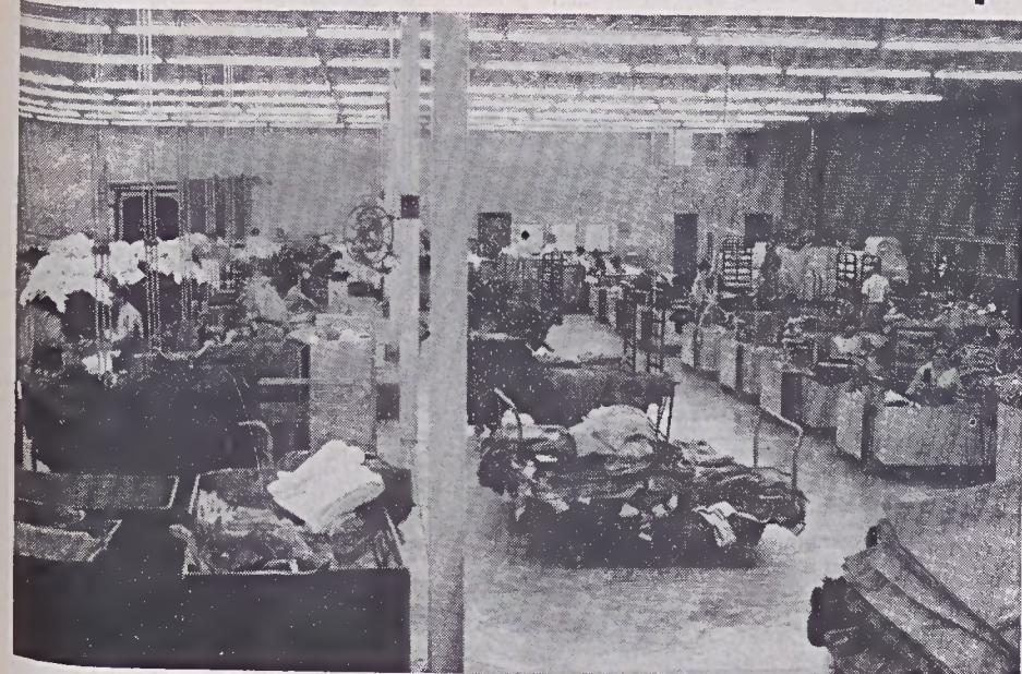
This over-all view shows the enlarged Drapery Department at the Bedspread Finishing Mill. The machines to the left are for pleating and sewing on rings; the truck operator is George R. Belcher; standhemming operation is performed by the machines at the right.