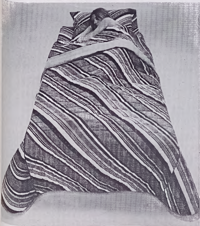
"Infinity" is Yves Saint Laurent's bold diagonal stripe design for Fieldcrest's newest sheets and pillow cases, with a quilted bedspread that cleverly reverses to a coordinated solid color.