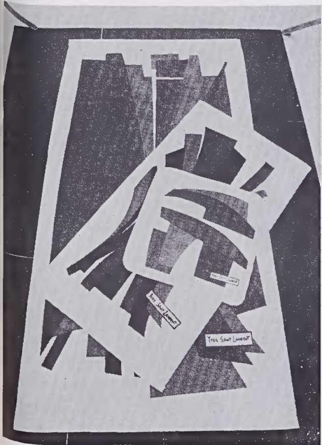
"Discovery" is bold, abstract print towel designed for Fieldcrest. Pattern includes bath, hand towels and washcloths, has designer's full name on a corner.