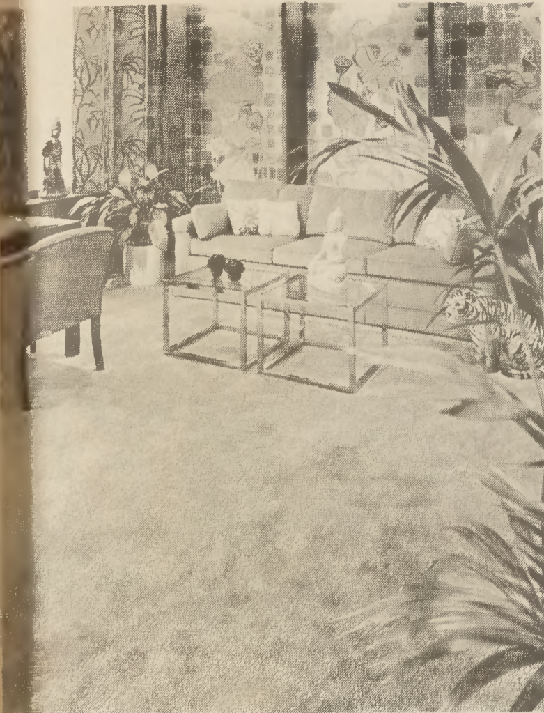
"Eloquence" is deep plush carpet of heavy nylon yarns.