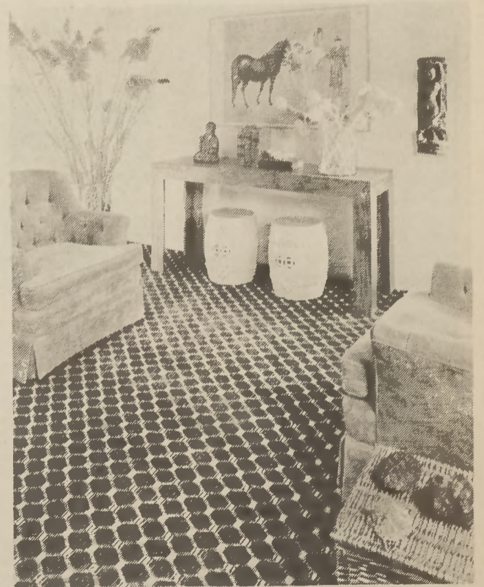
Well-suited for this comfortable den is Karastan's "Fortale #194" carpet. Densely woven of rugged, soil-resistant Antron 11 nylon "Fortale #194" features a hexagonal geometric pattern.