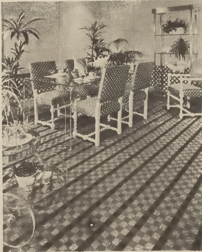
"Progression" features an eye-catching chessboard pattern with a design formed by alternating squares of looped yarns and cut pile yarns within bands of four different colors.