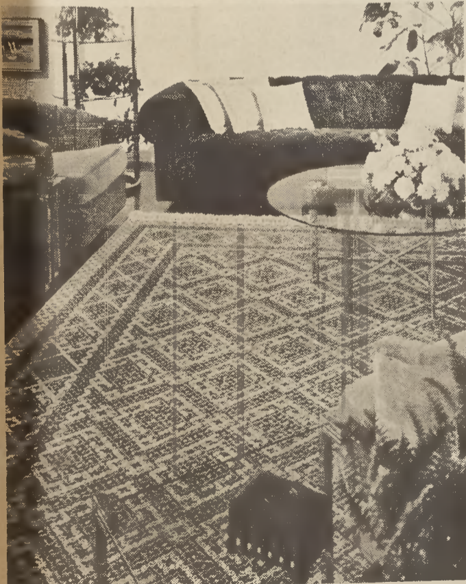
"Maniteau" borrows American Indian motifs to form a distinctive design of multi-level loop for a handcrafted look. The name "Maniteau" is derived from Shawnee word for "Great Spirit".