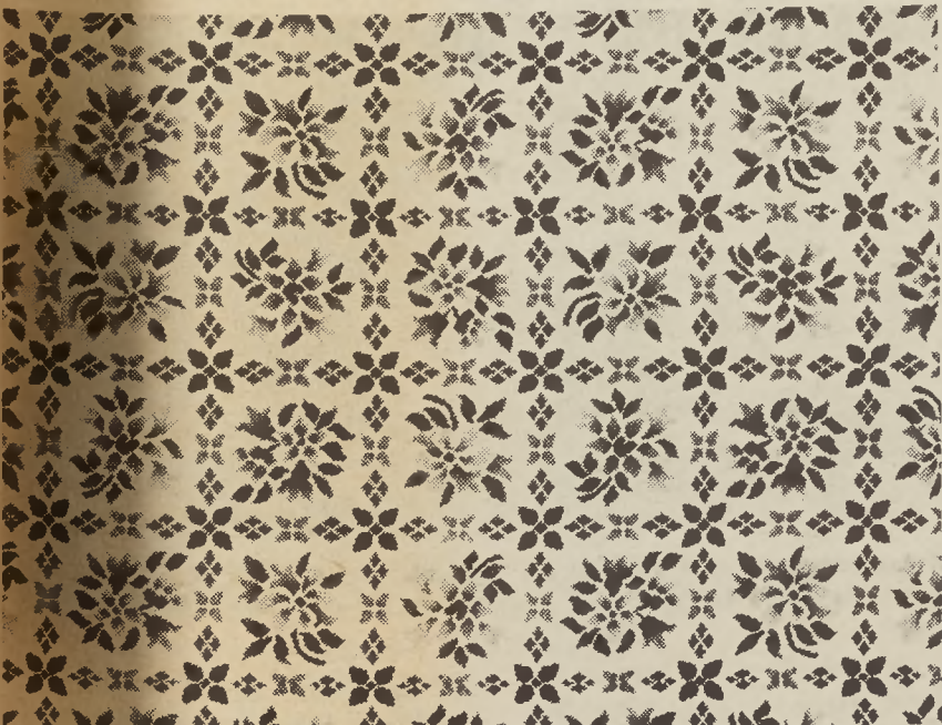
"Lancaster Grove" is what Karastan calls this traditional pattern in its new "Constitution Classics" collection. Woven on a new "gripper Axminster" loom of skein-dyed pure wool face yarns, it features a block floral design with the strong influence of the "stencil" pattern found in Pennsylvania Dutch and Early American samplers.

For its Fall '74 carpet and rug fashions, Karastan takes a proud look at America's heritage with an emphasis on the gracious lifestyle of the early days of the Republic.