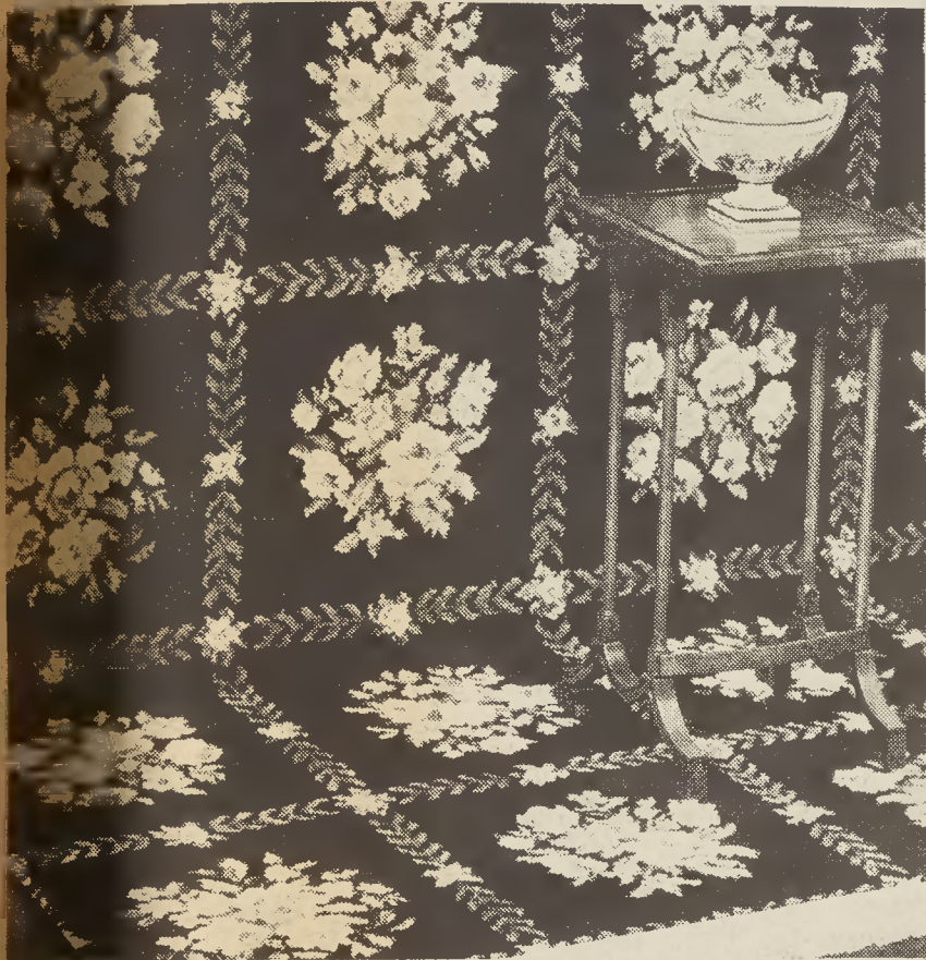
"Yorktown Hall" is the name given to this block rose bouquet design in Karastan's "Constitution Classics," a new collection of traditional patterns. Woven on a new "gripper Axminster" loom of skein-dyed pure wool face yarns, it presents the roses on an ebony black ground framed by lines of a Sienna Brown laurel leaf.