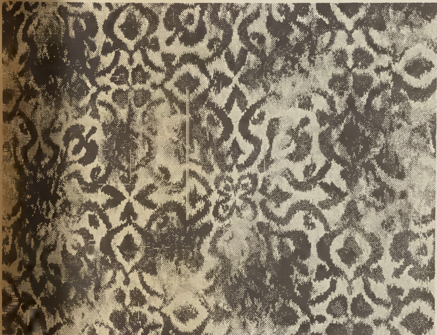
For its new "Excellency Collection" of high-performance commercial/residential carpets, Karastan has used its revolutionary Bondi System for an exceptionally dense cut-pile fabric of 100% Antron nylon face yarns.