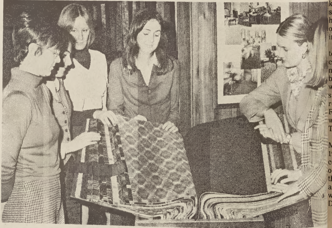
Cornell seniors and graduate students look over swatches in Karastan showroom.