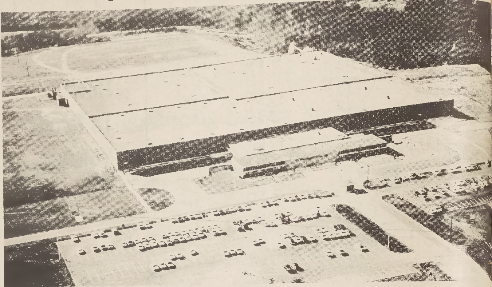
SHEET FINISHING MILL with Bedsread Finishing Mill adjoining at right

At first, all of the sheet finishing operations, including packaging, were performed at the old Bleachery. The cloth finishing was on the first floor with the cutting and sewing on