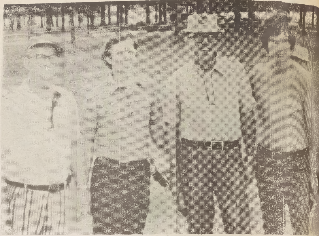
Winning team in 'Captain's Choice' golf tournament held at Columbus.