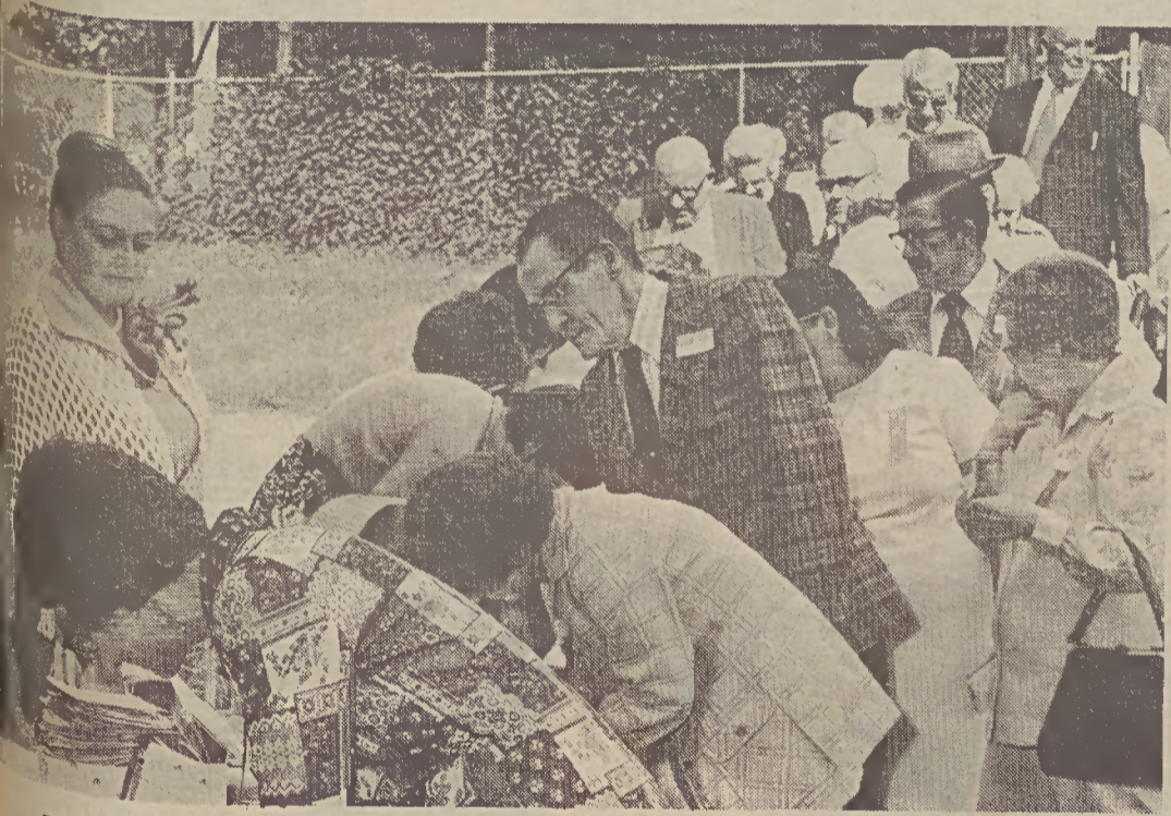
Fieldale 25-Year Club members register for attendance prizes and guessing game.

The Fieldale Towel Mill has a total membership of 387 in the 25-Year Club. Of this number, 215 are active employees and 172 have retired under the Pension Plan.