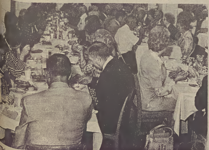
This is a part of the large crowd attending the meeting. A picnic supper was served in the cafeteria of the Fieldale Elementary School.