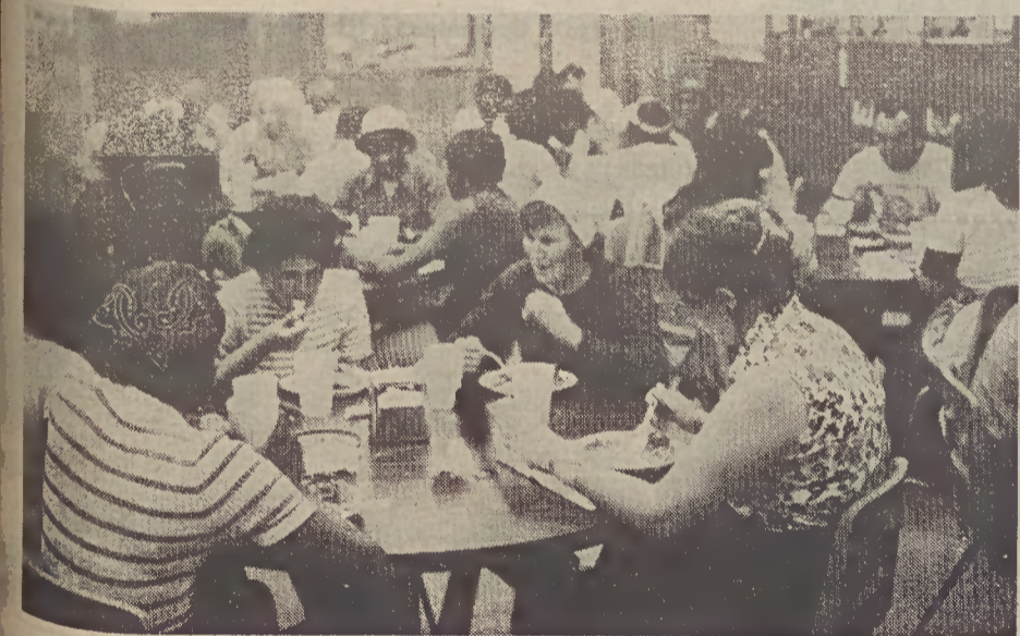
THIRD SHIFT EMPLOYEES enjoying barbecue dinner in Canteen.