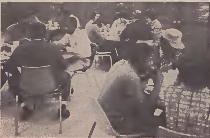
LAURELCREST CARPET MILL