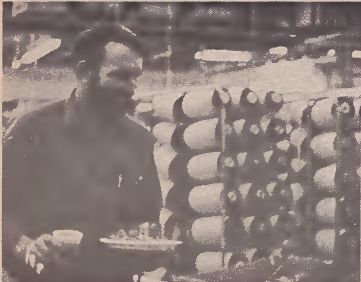
WINCHESTER SPINNING MILL

FOREMOST SCREEN PRINT — Foremost Screen Print employees have achieved an average of 2,129 man hours per employee, with a total of 340,000 accident-free hours. The Foremost safety barbecue was held on December 16. Their last lost-time accident occurred in September, 1974.