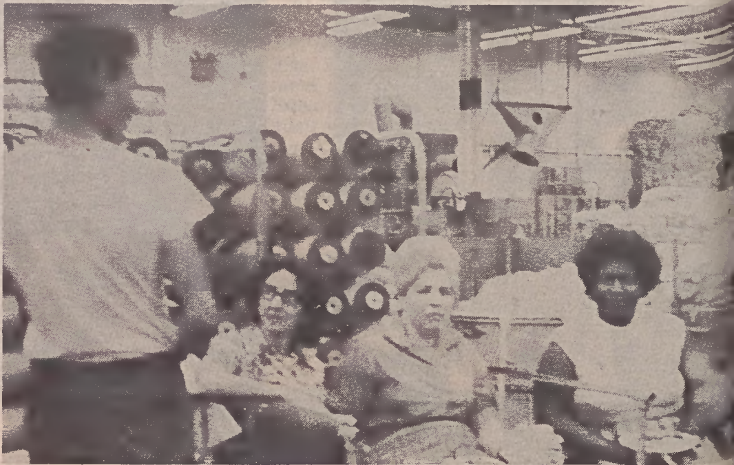
WINCHESTER SPINNING MILL