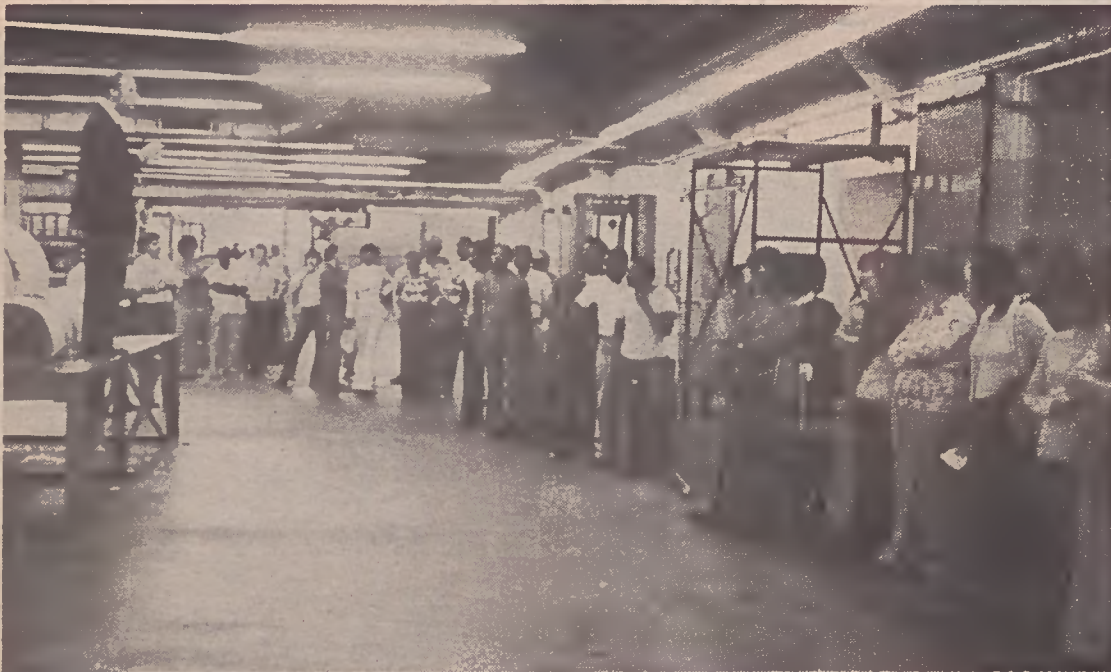
LAURELCREST CARPET MILL