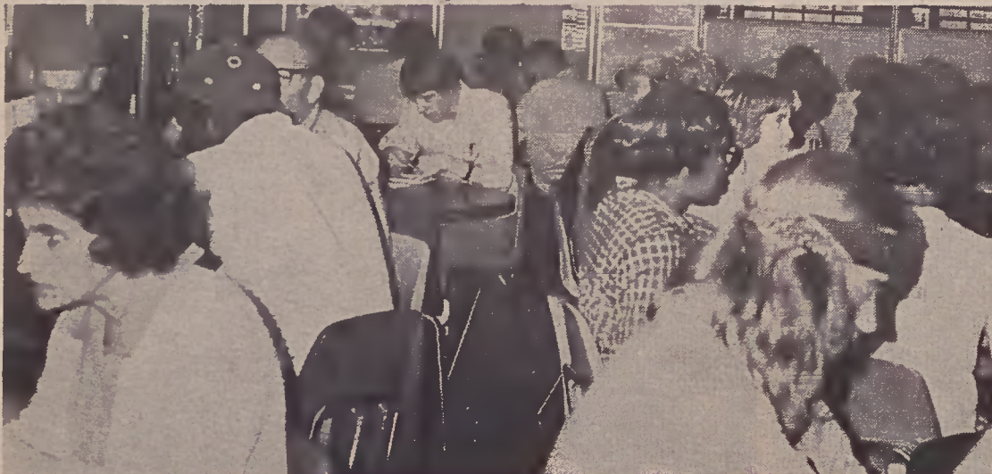
FOREMOST SCREEN PRINT PLANT