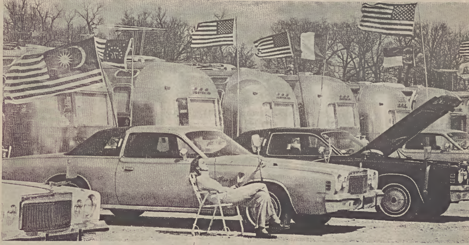
With flags flying, travel trailers of Caravan America, in which 200 foreign journalists will see America, rendezvous at Dayton,

me of the other companies icipating in the project are tream Trailers which is iding the travel trailers; isler Corporation which is assembly line to pull the