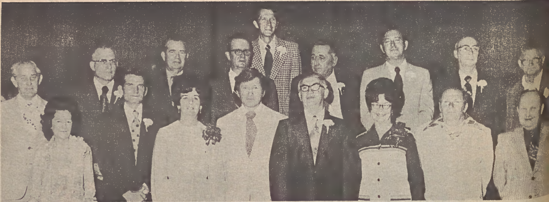
New Members of the 25-Year Club at North Carolina Finishing Co.