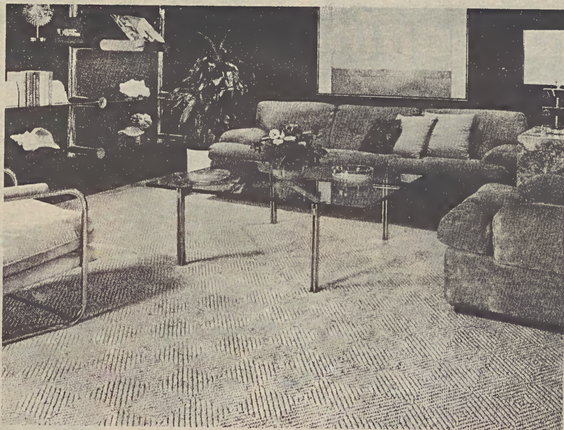
BERBEREAU PRISMS offers added styling approach to the prize-winning Berbereau quality.