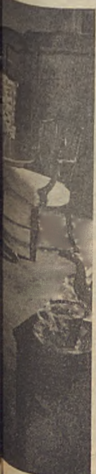
ance of a velour