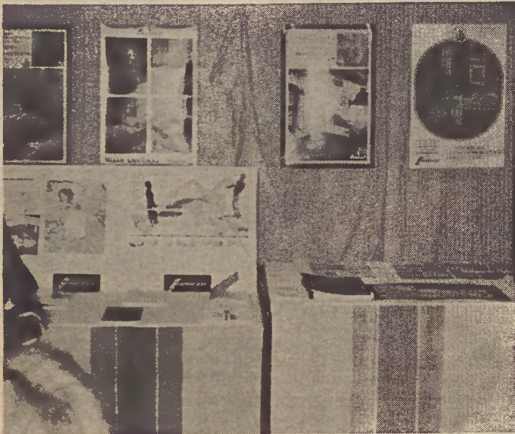
The Northeast Service Center display.

In addition to the industrial displays, exhibitors included antique displays, handicrafts, ethnic exhibits, a display of colonial dolls, colonial foods, an historical collage, and an environmental display.