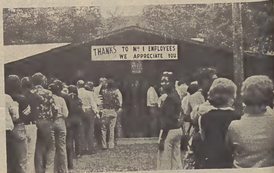
The meal was served in the pavillion.