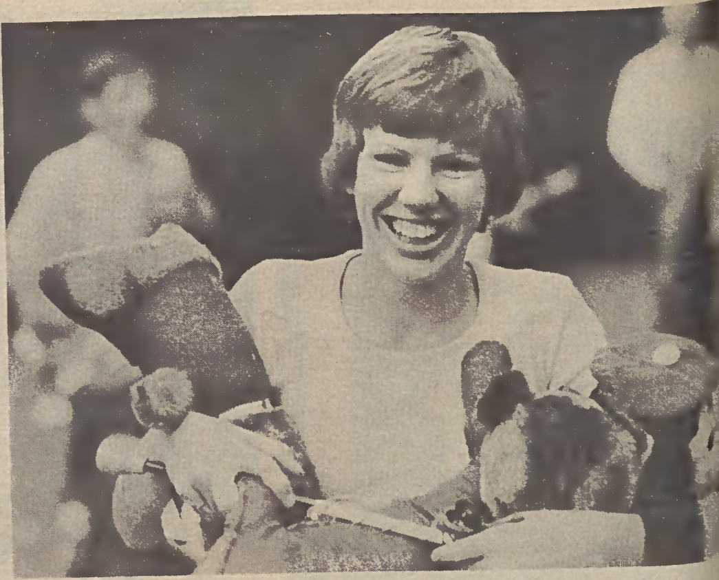
This young lady apparently hit the jackpot in the midway games.