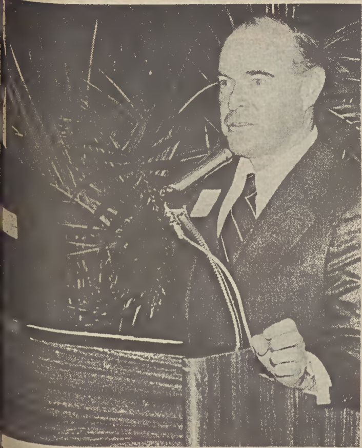
(right) president of Limited, to members of the New York magazine and newspaper press during the Fieldcrest Press Party.