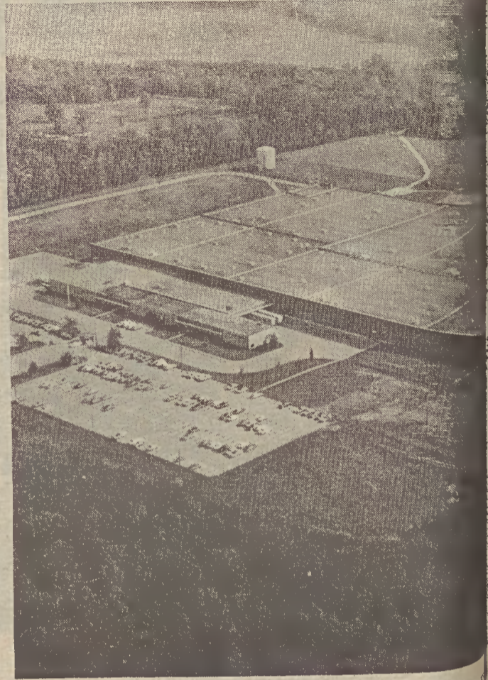
The Bedsread Finishing Mill, right, adjoins the Sheet

Operating some of the most modern equipment in the industry, the Bedsread Finishing Mill has added new and improved equipment over the years and has streamlined its operation for the highest degree of efficiency and production. It is expected that modernization and innovation will continue to improve this very important part of Fieldcrest's business.