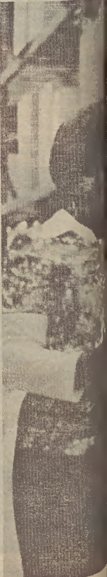
BETTY SCALES ping Department.