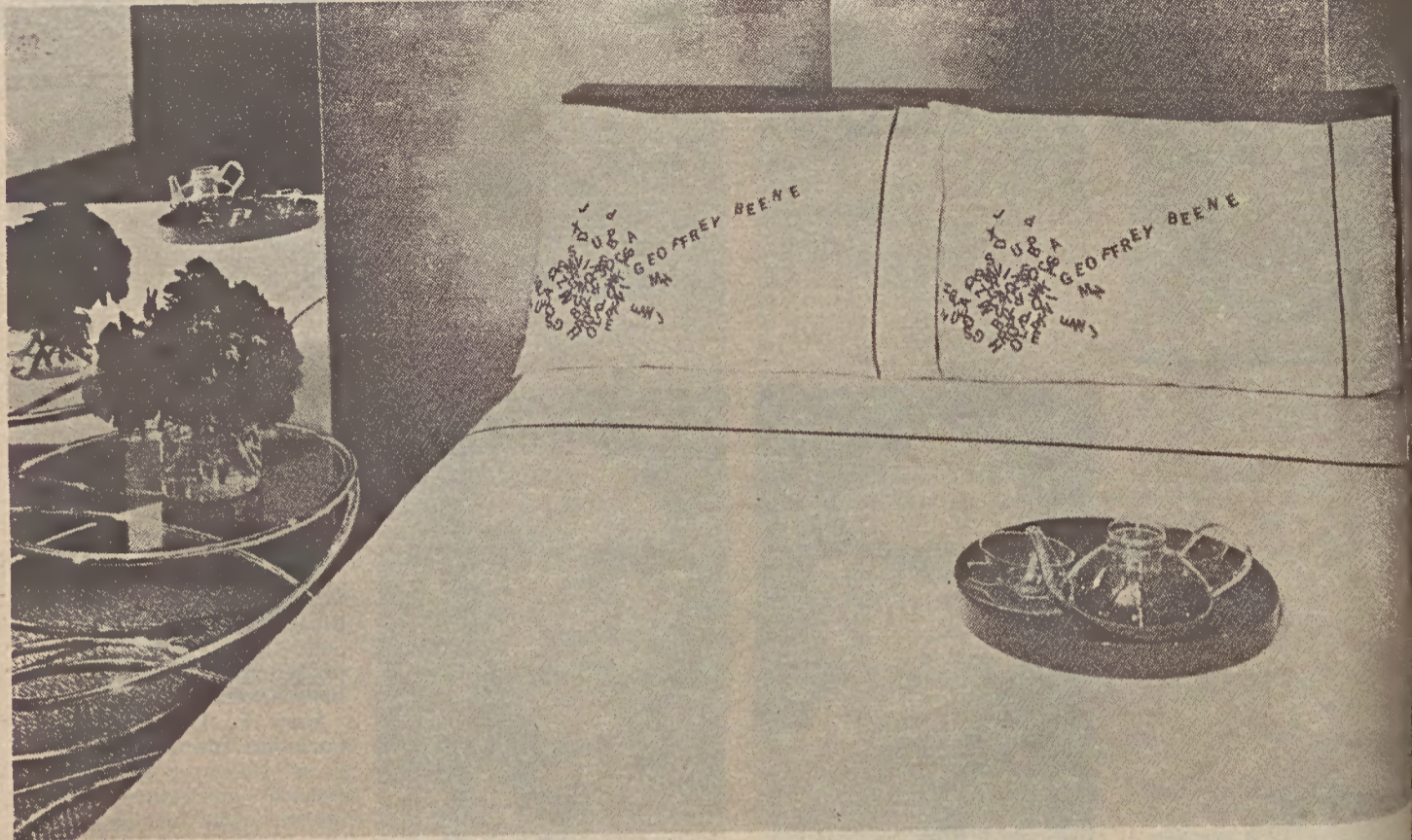
Red, vibrant and alive is Beene's innovative signature ensemble.

In his designs, Mr. Beene has succeeded in creating the most