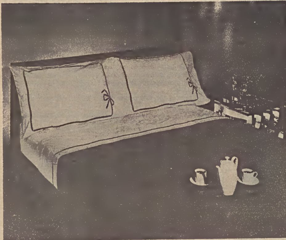
Pretty feminine red ribbons, tied with a bow on the pillowcase, are drawn on sheets and pillow cases of the palest silver in the Bow Ties design.

to become a solid success in the Fieldcrest line. Fashion oriented stores have demonstrated a very positive reaction to the extensive merchandising possibilities of the unique collection and the famed Beene name.