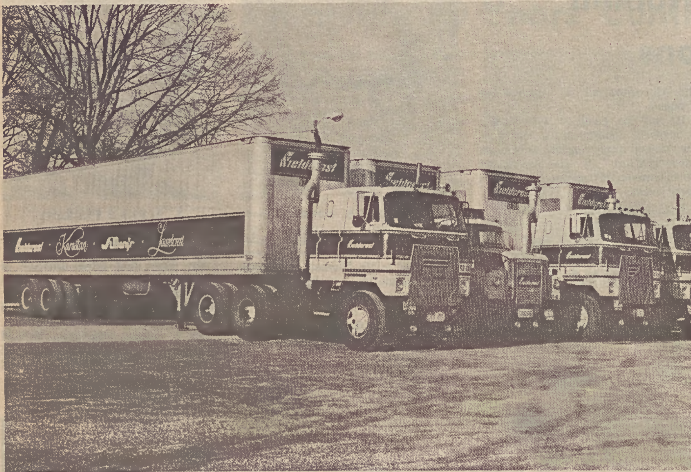
Ready and waiting, these trucks will soon be loaded and sent to various parts of the country.

With 18 over-the-road (long distance) drivers logging approximately 2 million miles a year, the Fieldcrest fleet daily covers 100,000 miles to and from every Fieldcrest manufacturing unit, transporting both raw materials on their way to be further processed into finished products, and finished products en route either directly to customers or to the company's various service centers.