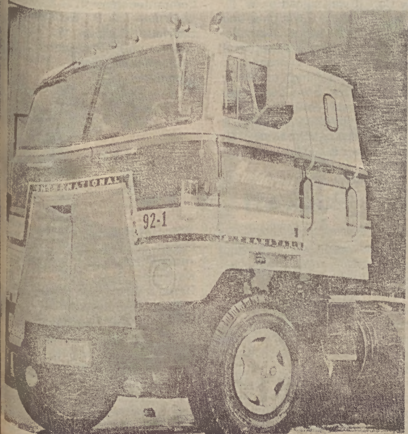
This truck is loaded and has been washed just prior to departure.