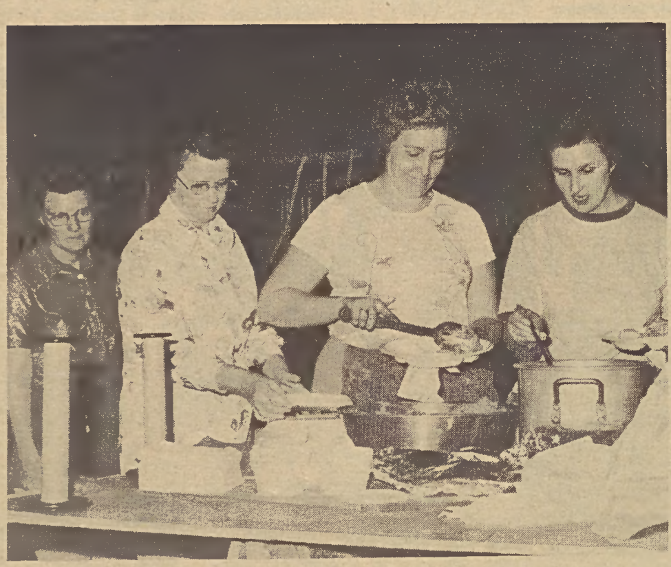
Karastan Worsted employees getting barbecue.