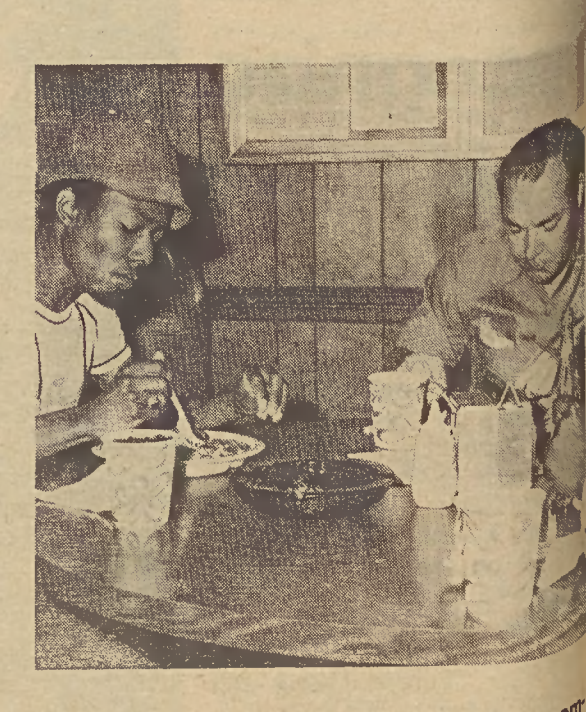
Digging in — Two Karastan Worsted ployees really seem to be enjoying their barbecue.