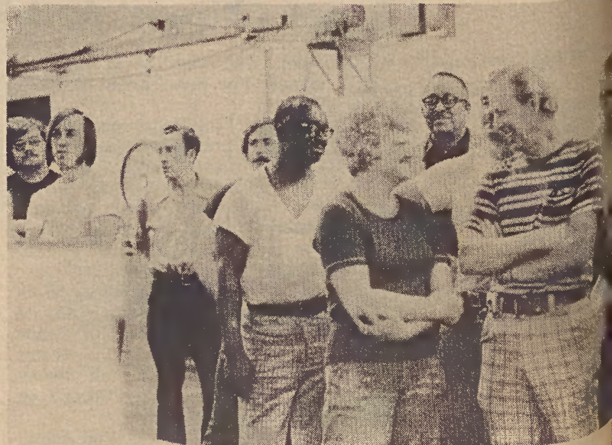
NON WOVEN MILL EMPLOYEES (above) enjoyed a safety barbecue recently for attaining 2,000 safe hours per employee.